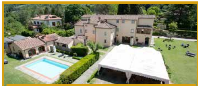
Torre Santa Flora Hotel

✝ Day 2 – Nov. 4: Arrive Rome / Subbiano Upon arrival in Rome we will meet our bus and make our way through the Tuscan countryside and check in to our hotel, Torre Santa Flora, in Subbiano. In the evening there will be a casual and relaxing reception followed by dinner. (D)